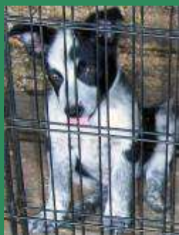
Bellamy, a beautiful Heeler X puppy rescued recently from a country pound and now in his new home.

We believe that most dogs end up on death row due to no fault of their own... Many in our community regard pets as disposable items.