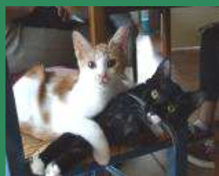
Just two of many kittens we rescued from Mildura Pound. Snooky (left) and Percy are special friends, and we were delighted to find them a home together.

We believe that most dogs end up on death row due to no fault of their own... Many in our community regard pets as disposable items.